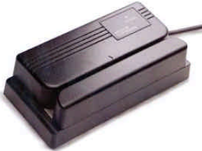
Barcode card slot reader