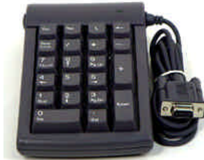
Student PIN pad