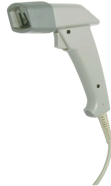
Hand-held barcode scanner (can be used with cards or barcode rosters)

Meal Tracker® Site Point of Sale users can serve with any of these devices . . . in any combinations!