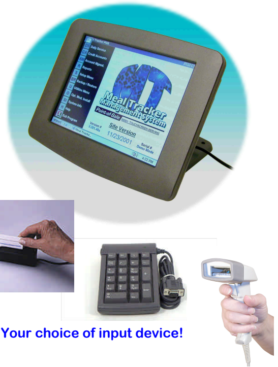
Your choice of input device!